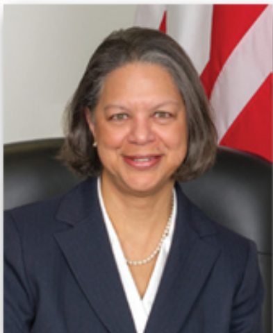
Joanne Doddy Fort Commissioner

Joanne Doddy Fort was nominated by Mayor Gray and confirmed as Commissioner by the Council effective October 3, 2012 for a term ending June 30, 2016.